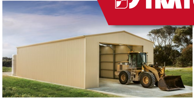
Single – Roller Door Gable End