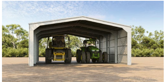
Open Gable Ends