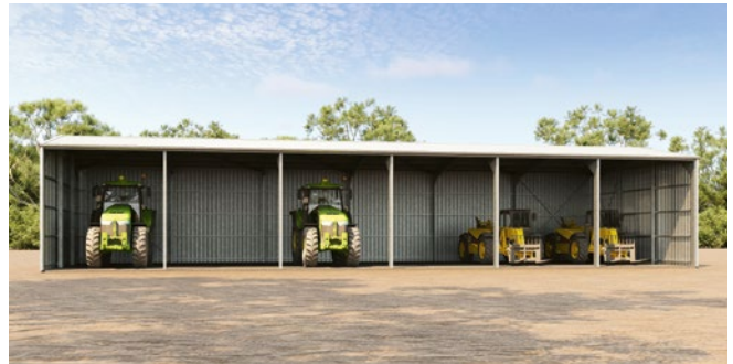
Open Sided Access