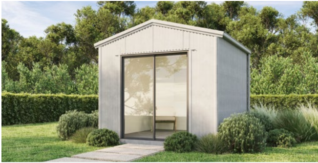
Gable Stubbie Studio