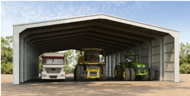
Open Gable Ends