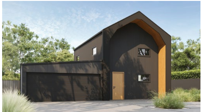
Double Gable Studio – With Garage