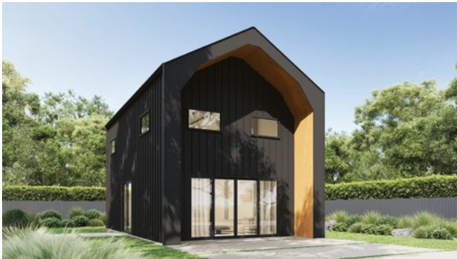
Double Gable Studio – Stepped Facade