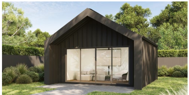
Single Gable Studio – Stepped Facade