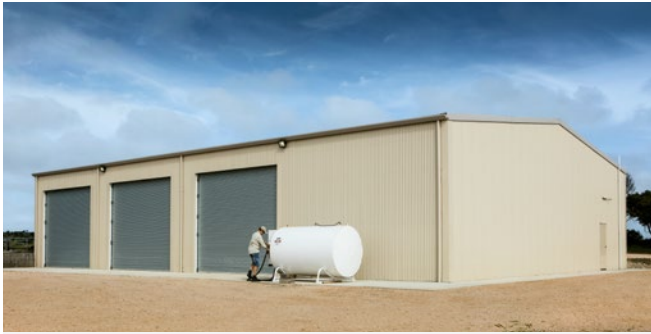
Triple – Roller Doors Gutter Side