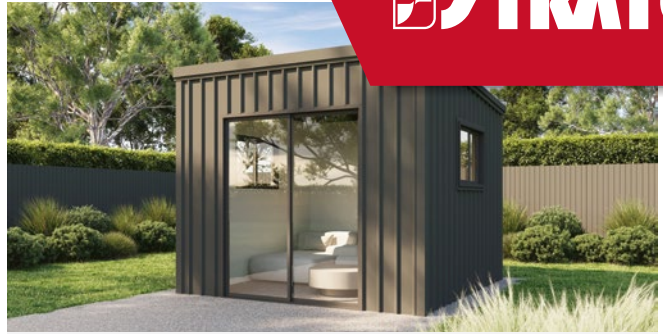
Skillion Stubbie Studio