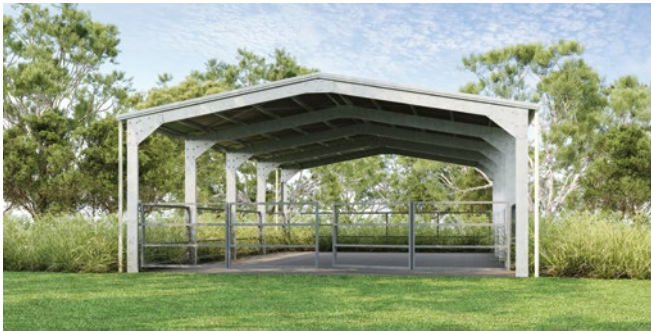
Open Gable – No Walls