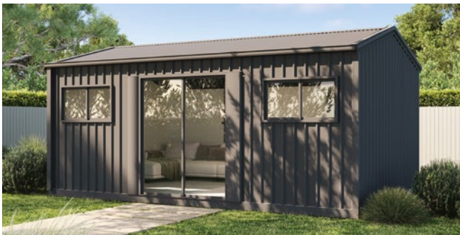
Single Gable Studio